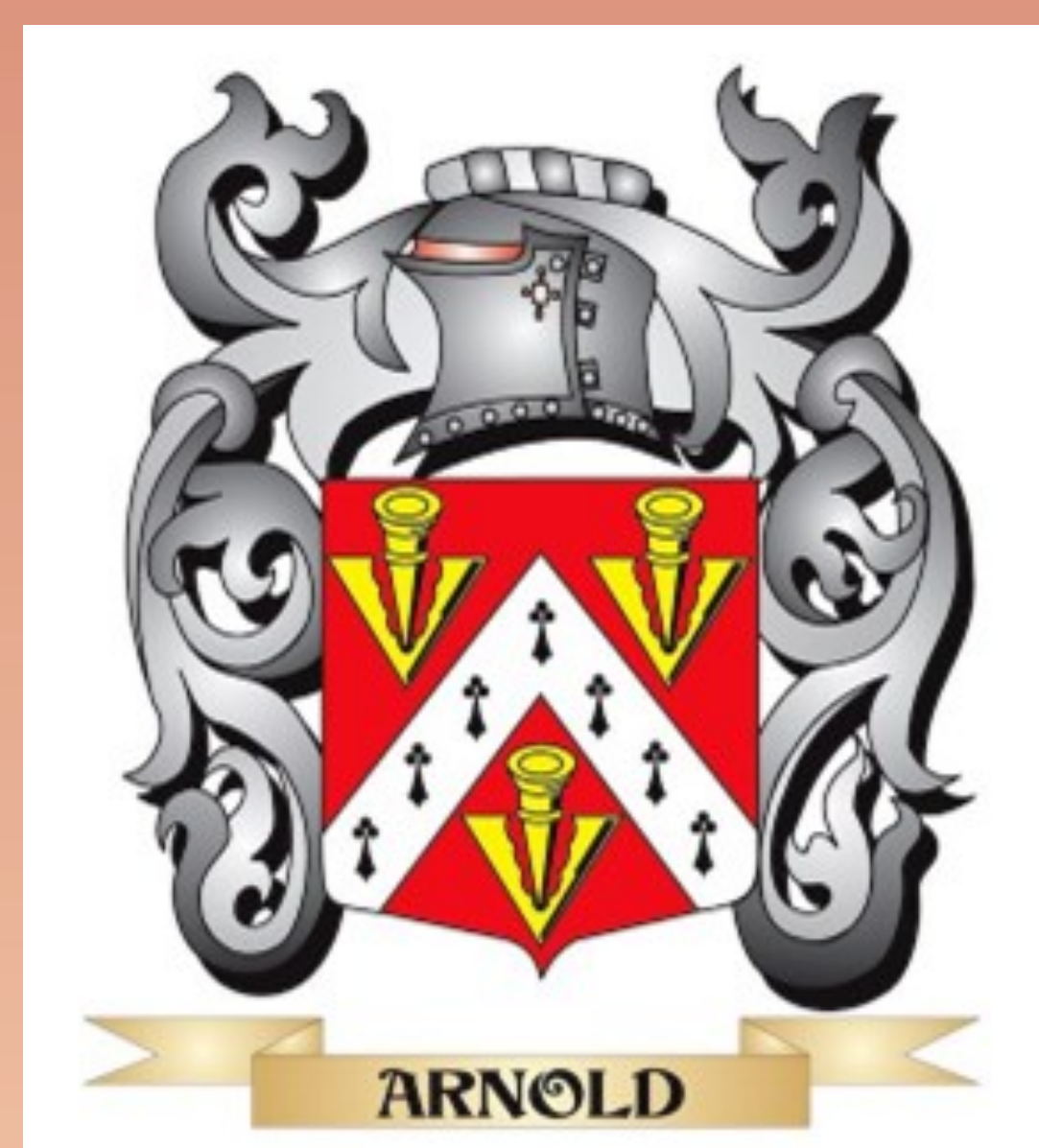
Figure 4: Example of an Arnold coat of arms .

For now, this heraldic bottle seal remains a mystery. If you’ve read this far and want to try your hand at heraldic research, maybe you can crack the case! If anyone out there has seen this crest, let me know at