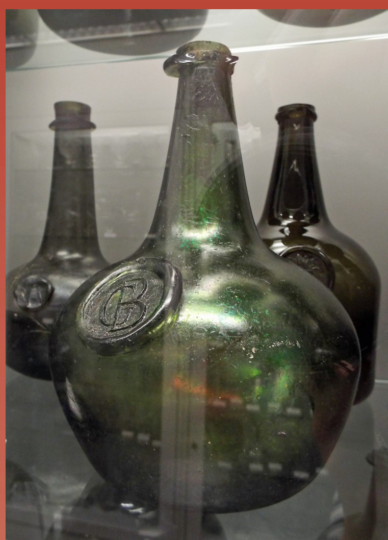
Figure 2: 18th-century sealed wine bottles on display in visible storage at the Corning Museum of Glass.

Old Baltimore (18HA30) was the first county seat of Baltimore County in the 17 th century, and the site is currently located on the U.S. Army Garrison Aberdeen Proving Ground. In the late 1990s archaeology conducted by R. Christopher Goodwin and Associates at the Old Baltimore site resulted in the discovery of a bottle seal with an elaborate coat of arms (Figure 1).