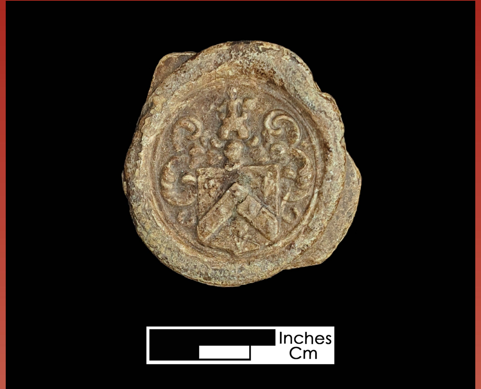
Figure 1: Heraldic bottle seal from Old Baltimore (18HA30/180).

died, at least 240 people owed him a total of 269,502 pounds of tobacco— the equivalent of £1,123! Nearly half of these debts were unenforceable because the debtors died insolvent or ran away.